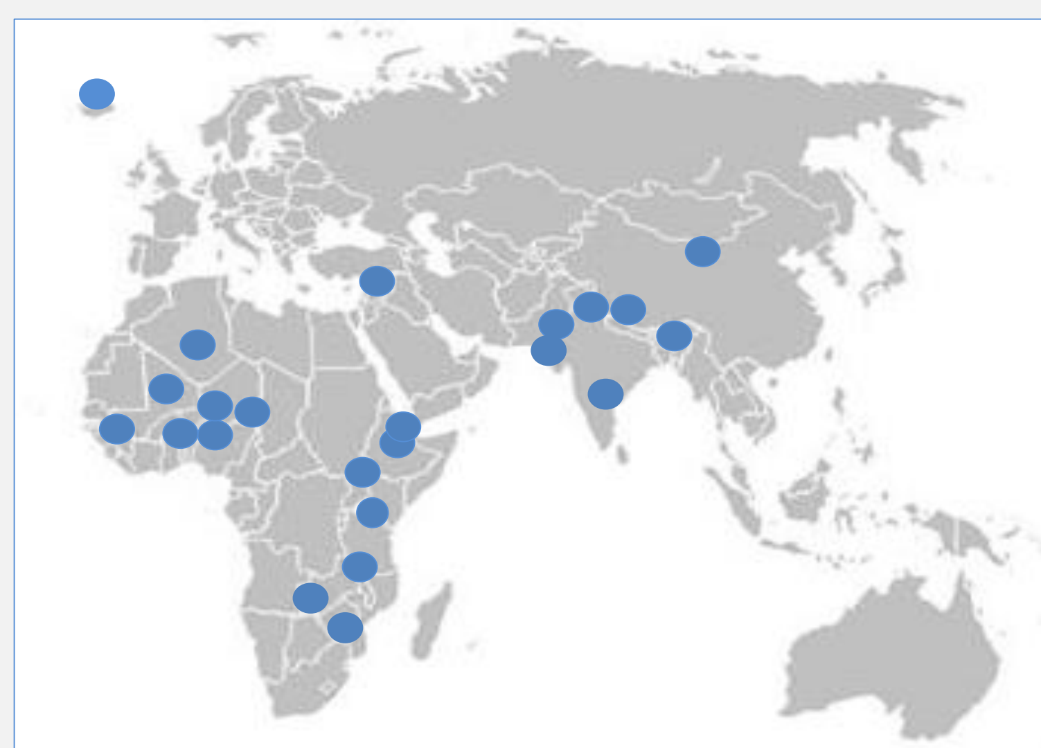
Some of BGS Groundwater's international projects since 2011